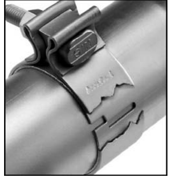
AccuSeal, with Torca designed slots, provides optimal seal and joint retention performance.